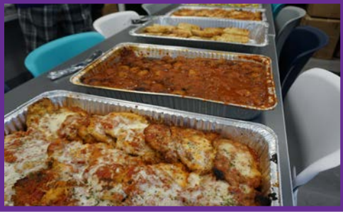
CASA MIA AT THE HAWTHORNE Chicken Parmigiana