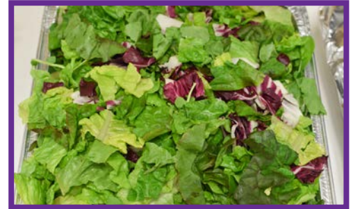
MAX A MIA Tuscan Salad