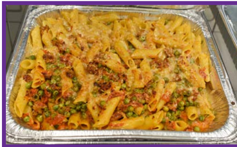
MAX-A-MIA Penne al Buttera