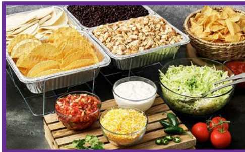
MOE'S SOUTHWEST GRILL Taco Bar