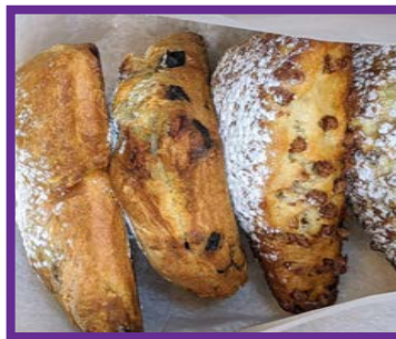
PASTRAMI ON WRY