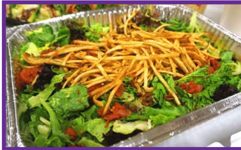
PASTRAMI ON WRY Black 'N Blue 'N Yellow Salad