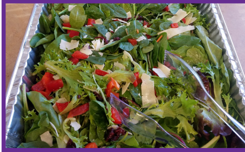
CASA MIA AT THE HAWTHORNE Spinach & Kale Salad