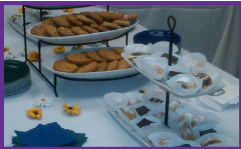
FIRST & LAST TAVERN Assorted Desserts