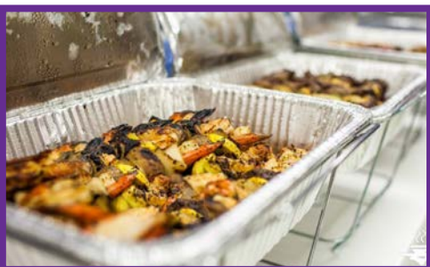
DIAMOND PUB & GRILL Pub Style