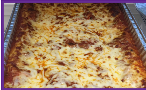
GALLERIA RESTAURANT Meat Lasagna