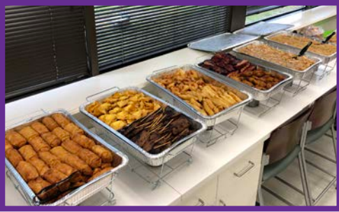
BUTTERFLY CHINESE RESTAURANT