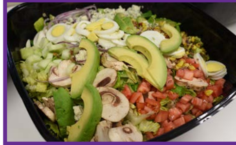
MAGGIE MCFLY'S Cobb Salad