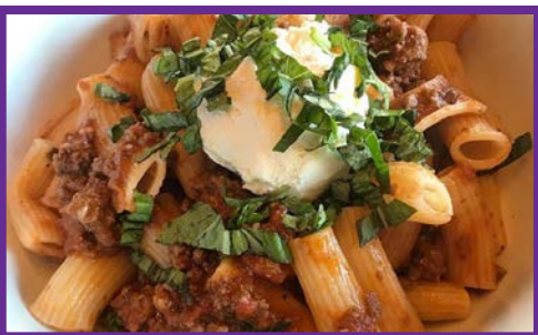
SORELLA Rigatoni Bolognese