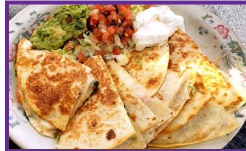
PUERTO VALLARTA Quesadilla Platter