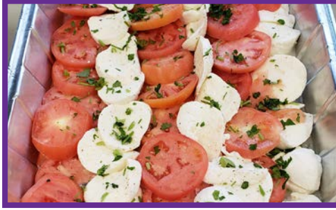
ARTICHOKE BASILLE'S Tomato & Mozzarella