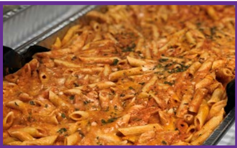
JOEY'S PIZZA PIE Penne ala Vodka