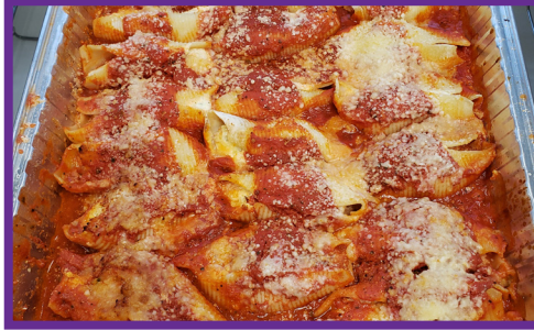
CUGINO'S OF FARMINGTON Stuffed Shells