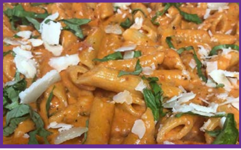
ANDY'S ITALIAN KITCHEN Penne ala Vodka