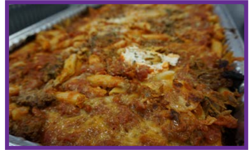
CASA MIA ON THE GREEN Baked Ziti