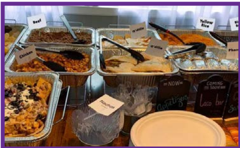
Quesadilla & Phorrito Buffet