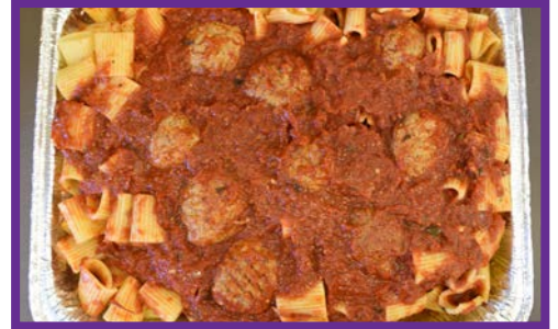
E&D PIZZA COMPANY Rigatoni & Meatballs