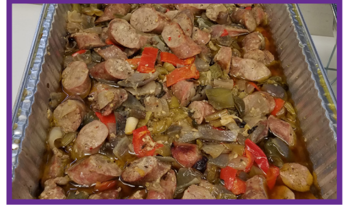
CARBONE'S KITCHEN Sausage & Peppers