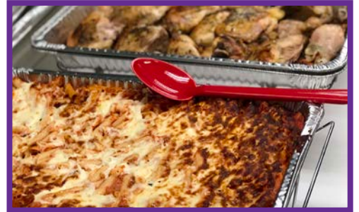
PARADISE RESTAURANT & PIZZA Baked Ziti