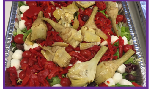
DA CAPO Toscana Salad