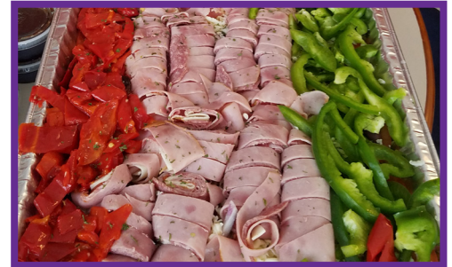
GIOVANNI'S BRICK OVEN PIZZERIA Antipasto Salad