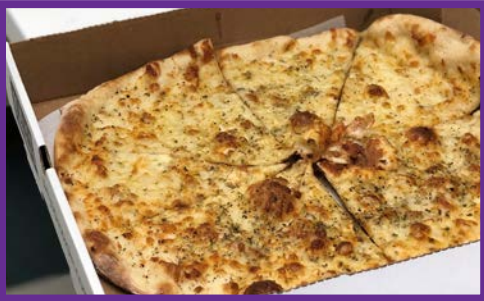
JOEY GARLIC'S Garlic Focaccia