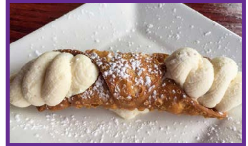
DA CAPO Assorted Cakes, Cannoli, Tiramisu