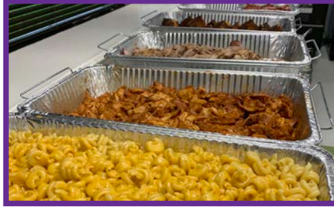
QUE WHISKEY KITCHEN