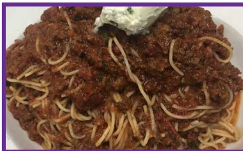
THE WINGED BEAR Spaghetti Bolognese