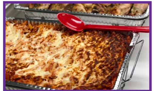
PARADISE PIZZA Baked Ziti