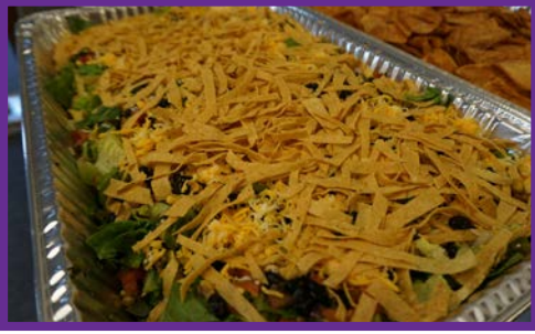
ARTISANAL BURGER COMPANY Southwestern Salad