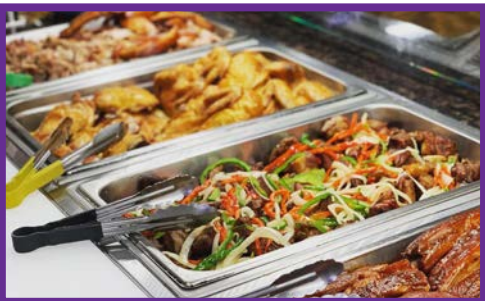
CROILLISIMO Puerto Rican