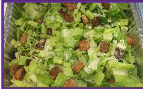
GALLERIA RESTAURANT Caesar Salad