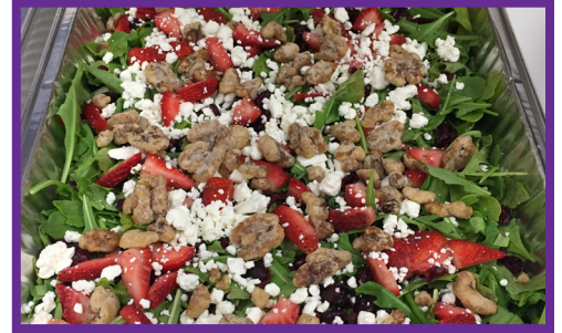
DISH 'N DAT Summer Salad