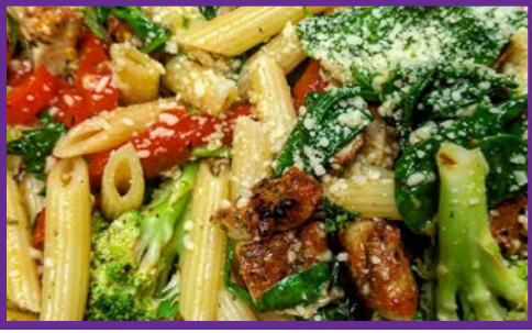
ANTONIO'S RESTAURANT Pasta Primavera