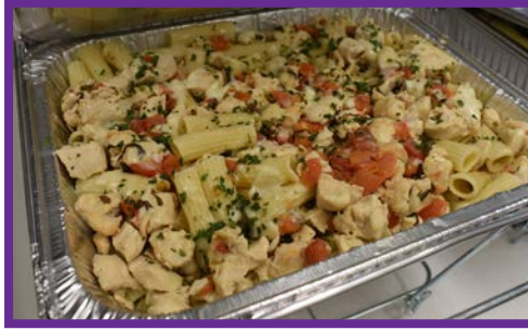
BERTUCCI'S Chicken Scampi