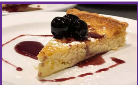
MAX A MIA Polenta Cake