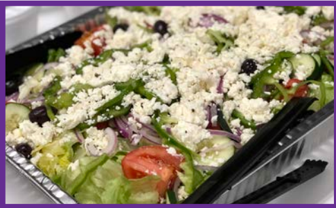
PARADISE PIZZA Greek Salad