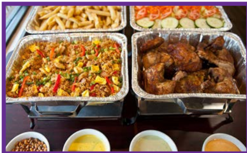
THE ROCKIN CHICKEN Peruvian