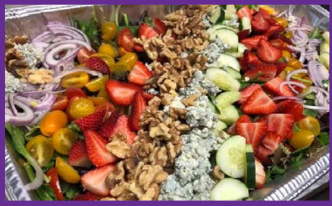
BENNY'S OF SIMSBURY Summer Salad