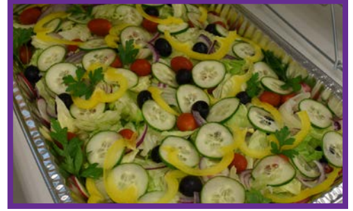
BELVEDERE Garden Salad