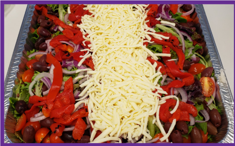
E&D PIZZA COMPANY Gorgonzola Salad