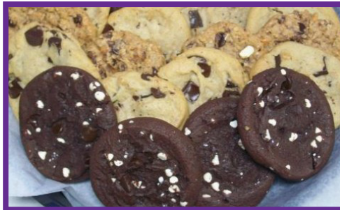
GOLDBERG'S Assorted Cookies & Dessert Bars