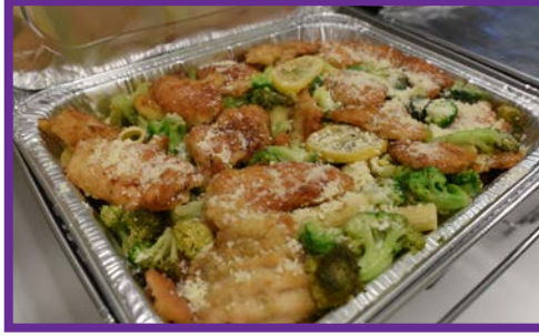
BERTUCCI'S Rigatoni, Broccoli & Chicken