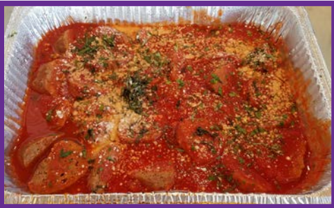
RIZZUTO'S Petite Meatballs