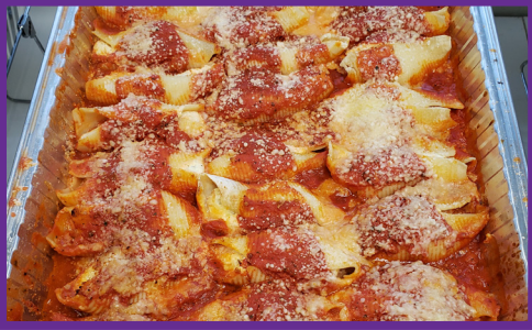
CUGINO'S OF FARMINGTON Stuffed Shells