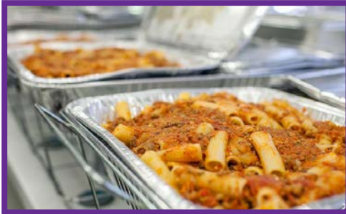
MAX A MIA Rigatoni Bolognese