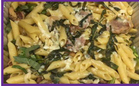
DA CAPO Sausage & Broccoli Rabe