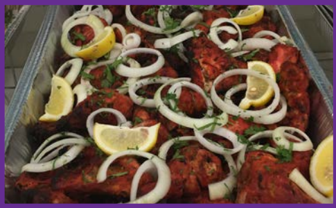
AVON INDIAN GRILL