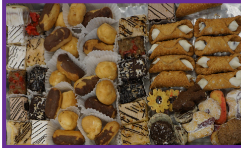
CASA MIA AT THE HAWTHORNE Assorted Italian Pastries