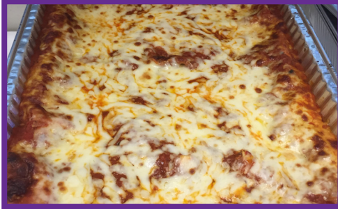
GALLERIA Baked Ziti