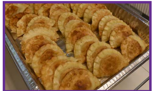
BELVEDERE OF EAST WINDSOR Polish