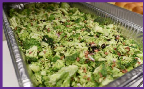
HONEY BAKED HAM Broccoli Bacon Bliss