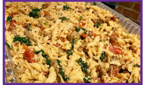
GIOVANNI'S BRICK OVEN PIZZERIA Salsiccia Pomodoro