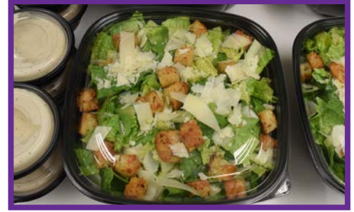
BERTUCCI'S Caesar Salad