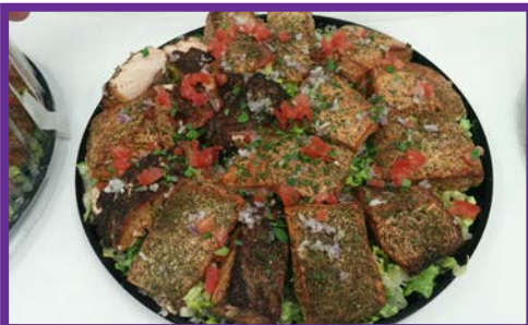
DEEPWATER SEAFOOD Cedar Plank Salmon