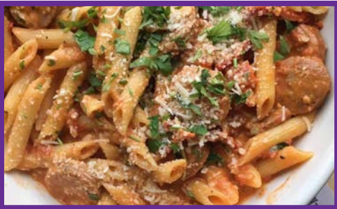
FIRST & LAST Penne & Sausage