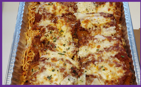
E&D PIZZA COMPANY Eggplant Parmigiana