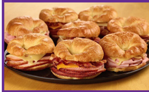
HONEY BAKED HAM