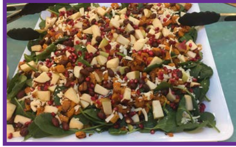
B.GOOD Roasted Butternut Squash