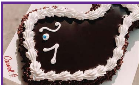
CARVEL Ice Cream Cake