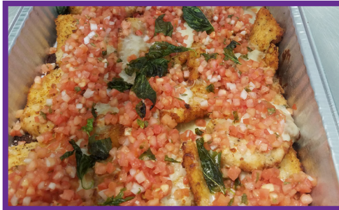
SORELLA Bruschetta Chicken