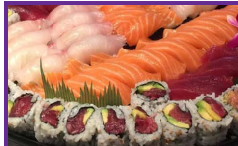
LIKI SUSHI Sushi & Sashimi Platter