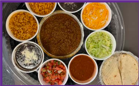
ACAWE GRILL Taco Kit